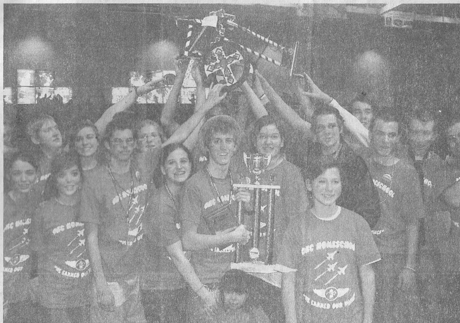
The Oklahoma City Home School Robotics team celebrates their second-place finish at a regional competition.

Adding to the challenge was the need for the home school team to raise funds